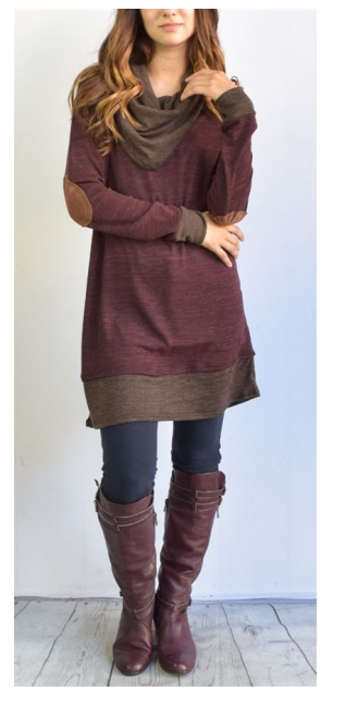
<u>In</u> dress code leggings:

Leggings may be worn under a skirt/dress/tunic as long as the skirt/dress/tunic is no shorter than two inches above the knee.