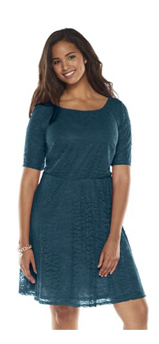
Out of dress code dresses and skirts (too short or too tight):