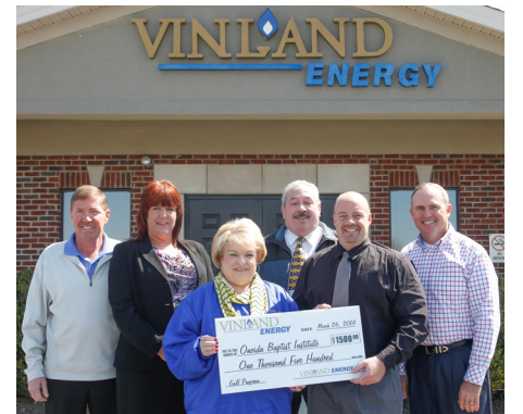
(Above) Vinland Energy gave OBI $1,500 to help us re-start our golf program.