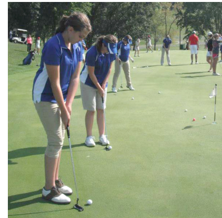
Oneida girls warming up before their first golf match in school history