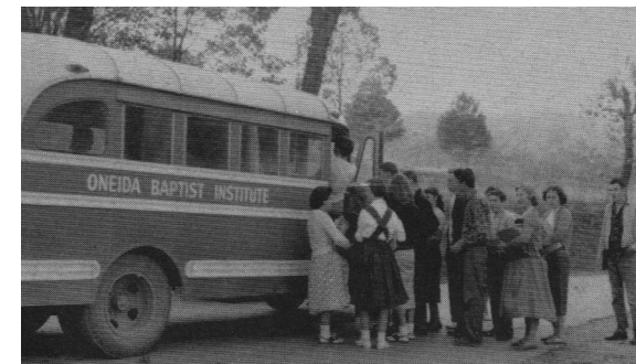
Riding the bus in 1959.....and today