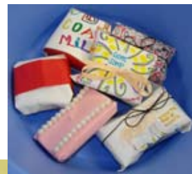
Wrapped bars are decorated and then taken to the OBI Gift Shop for sale -- $4 per bar for our student aid fund.