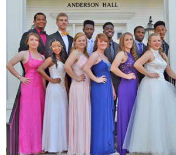
The annual Junior/Senior Banquet is always a very lovely evening. Students dress in formal wear and enjoy a special meal that includes steak and shrimp. This group posed on the porch of historic Anderson Hall before the dinner.