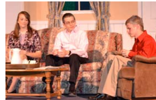
Our drama department did four productions of the spring play. The first was a matinee for area school children, and the last was preceded by our annual Alumni and Friends Dinner.