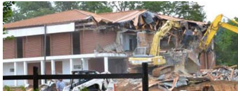
The demolition took three days of tearing down and carting off debris. At right -- All of Carnahan Hall that remained on the last morning.