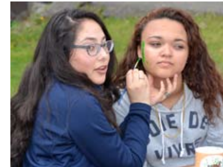
The weather was perfect for our yearly Spring Fling. Attractions included face painting, tie-dyeing, inflatables, a dunking booth, outdoor games and more... plus burgers, fries, cotton candy and ice cream.