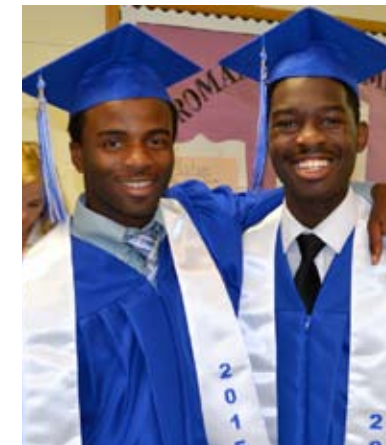
On May 16 we observed our 107th Commencement. 44 of the 51-member class earned Advanced Diplomas. Congratulations, Class of 2015!

Save the date! Homecoming 2015 will be October 24