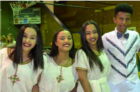
The February International Bazaar celebrated the diversity of our student body with food from around the world.