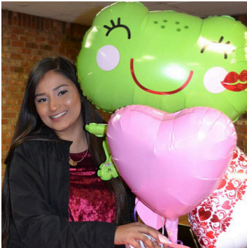
Each student got a valentine.