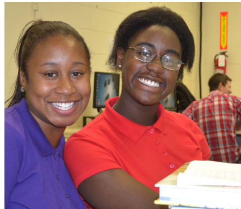
These two friends were all smiles on the first day of school.