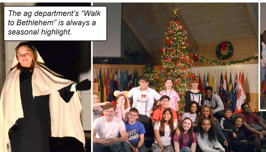
The ag department's "Walk to Bethlehem" is always a seasonal highlight.