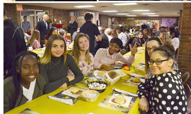
Left: Staff, students and guests enjoyed a delicious Thanksgiving dinner with all the trimmings.