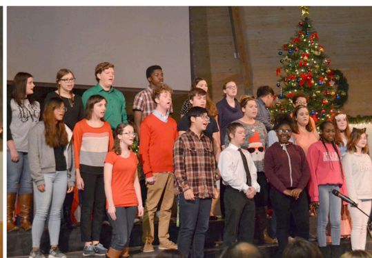
Above: Our choir (pictured) and Lower School children sang in the annual chapel Christmas program.