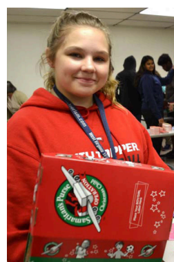
Clockwise from below: