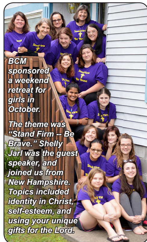
BCM sponsored a weekend retreat for girls in October.