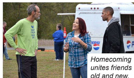
Homecoming unites friends old and new.