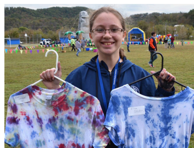
Tie-dye is always a hit at the Fall Festival.