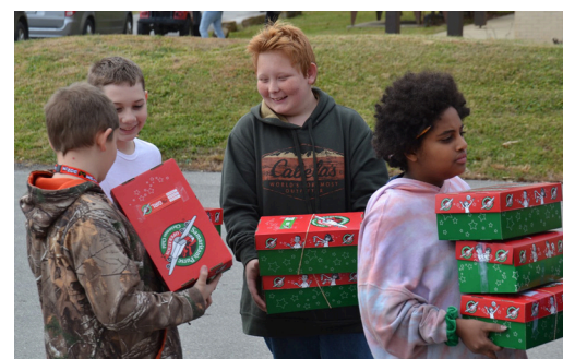
OBI sent 65 shoeboxes to Samaritan's Purse's Operation Christmas Child! In chapel we prayed over the boxes before they were loaded.