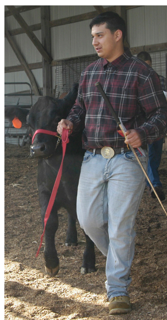
Homecoming 2019 began with our annual livestock show at the OBI farm. Students demonstrated their animal husbandry skills.