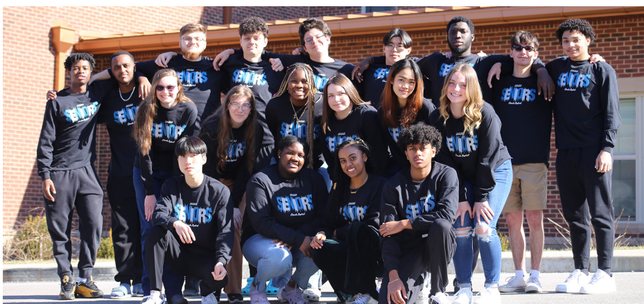
The Class of 2022 graduation exercises took place May 14, 2022. This year's graduating class was comprised of four local day students. Of our dormitory students, four were from Kentucky, three were from other states including New York, Louisiana and Colorado, and seven international students from Ethiopia, Nigeria, South Korea, Thailand and Togo.