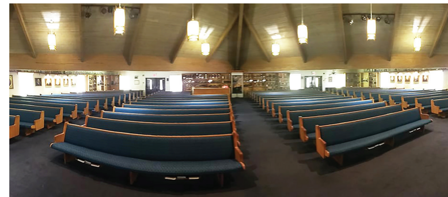
Chapel pews reupholstered ahead of schedule! Thanks to our faithful supporters, this much-needed project was able to be completed in June, 2021.