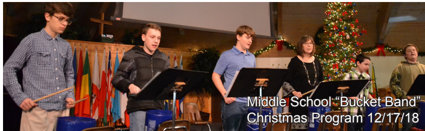
Middle School "Bucket Band" Christmas Program 12/17/18