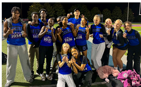
The above OBI Track and Field athletes earned regional medals, and nine who placed 1st, 2nd or "At Large" in their events advanced to the state track meet in May.