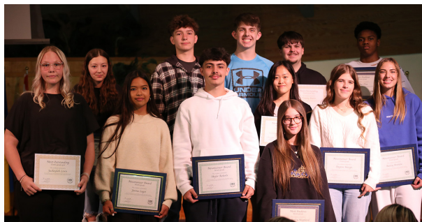
Above two photos: Middle and High School Yearbook Award recipients in chapel on May 5th.