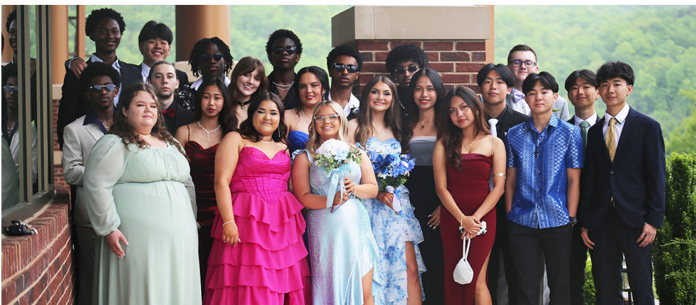
Jr./Sr. Prom 2025 — The annual Junior-Senior Prom and Banquet was held May 4th in Underwood Hall. The Class of 2025 is pictured.