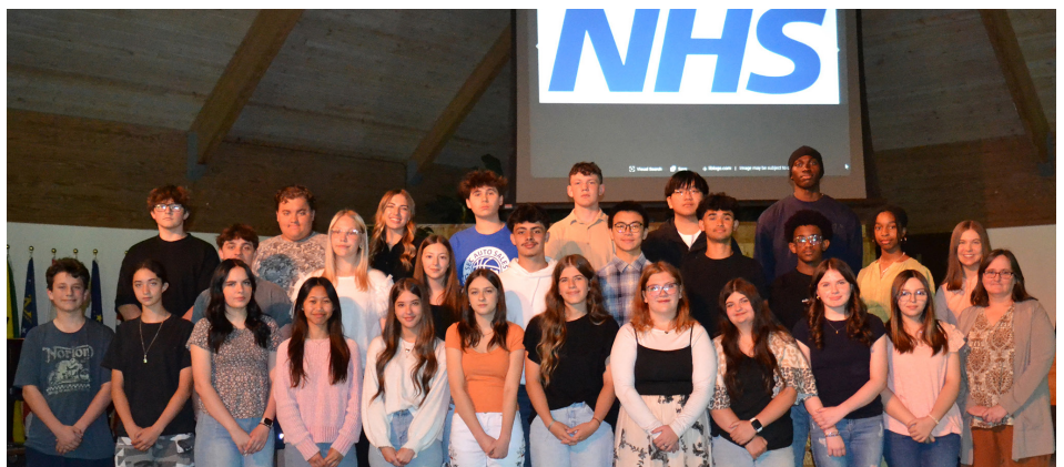
NHS/NJHS — Congratulations to OBI's newest members of the National Honor Society and National Junior Honor Society. The induction ceremony was held on May 2, 2025.