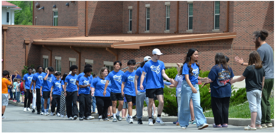
SENIOR WALK 2025 — The rain held off long enough for us to enjoy this special tradition on our last day of school!