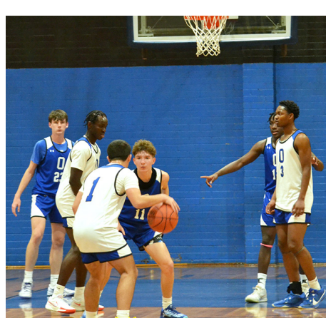
Blue & White Night on November 10th was a great kick-off to basketball season. Students, staff and fans gathered in Sparks Gym to enjoy a night of meeting the teams and cheerleaders and watching Blue-on-White scrimmages and other contests.