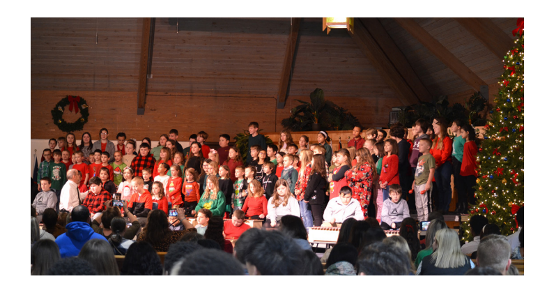
The Upper School Choir and Lower School presented the annual Chapel Christmas Program on December 13th.