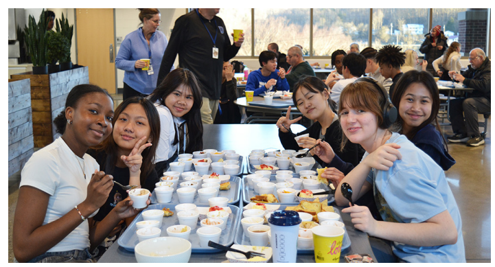
"Souptacular" Fellowship! Students and staff enjoyed a buffet of homemade soups on the last Wednesday in January. About a dozen staff members participated in cooking and serving their favorite recipes.