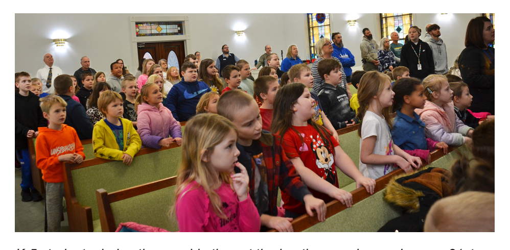
K-5 students during the worship time at the baptism service on January 31st.