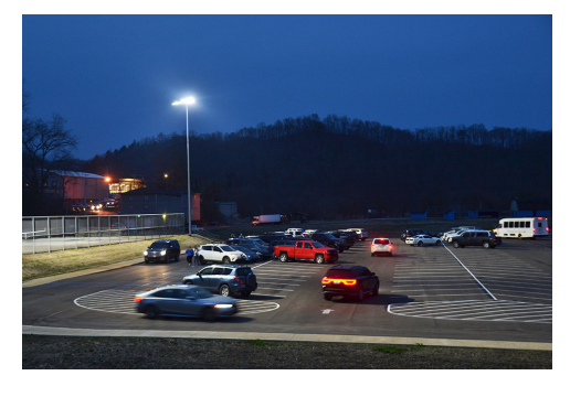
An additional 142 parking spots in two new lots on campus greatly improved the event for our guests. We provided a shuttle bus for those who parked in the lot by the new track.