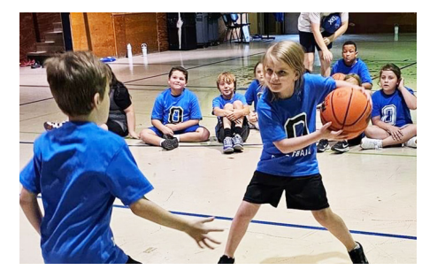
Basketball Camp in July —Local children in grades 2-8 had a free fun day on campus learning about basketball and Jesus.