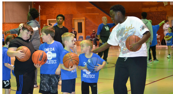
Lower School Basketball —K-5 enjoyed basketball and cheerleading opportunities on several Saturdays this fall. OBI basketball players assisted in coaching.