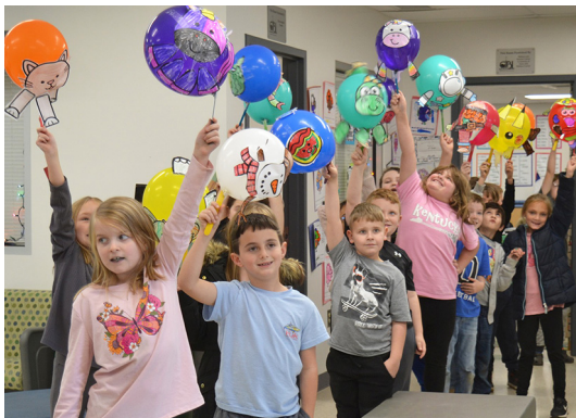
The Lower School celebrated Thanksgiving with their very own "Macy's Day Parade" presented by the K, 1st & 2nd grade classes.