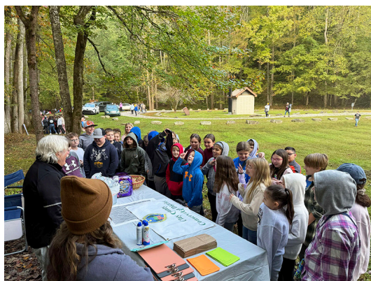
On October 8th, our 4th and 5th graders had a fun day of learning at the 4H Environmental Field Day held at the Big Double Creek Campground near Peabody, Ky. Topics included renewable and non renewable resources, animals native to our area and wildlife management, wetland ecology, birds of prey, the function and importance of trees and much more! Thanks to the 4-H Youth Development and the Clay County Cooperative Extension Service for hosting this event!