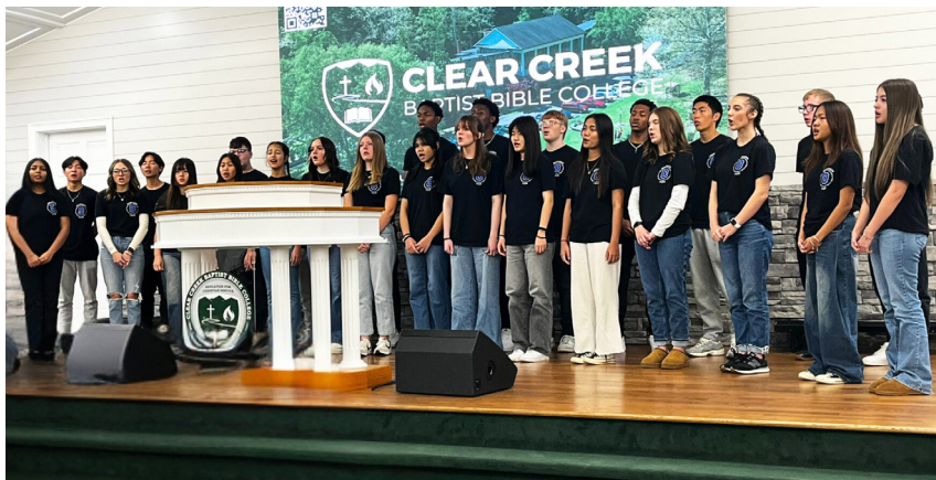
The Upper School Choir sang at the November 20th chapel service at Clear Creek Baptist Bible College.