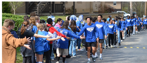
The entire school lined Mulberry Street for the soccer team's State Send-Off.

The OBI Boys' Soccer team had a record-breaking 19-5 season winning the KHSAA 13th Region championship and advancing to the state tournament and "Final Four" of high school soccer. This is the first time in school history that an OBI soccer team has won a KHSAA regional championship.