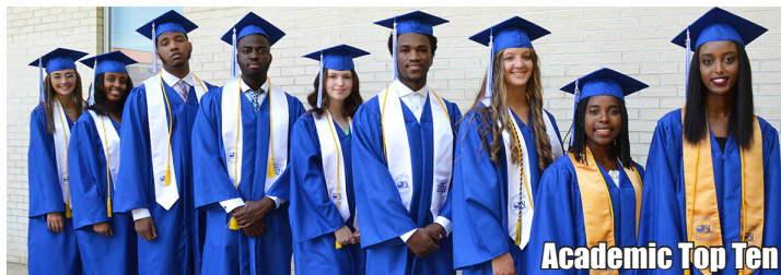
Academic Top Ten