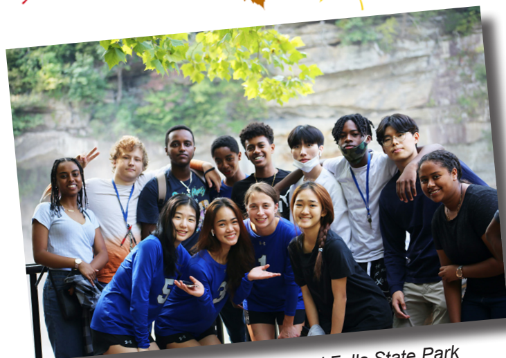
9.11.21—Dorm Trip to Cumberland Falls State Park