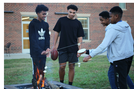
S'Mores Night in the courtyard between the dorms on 10.20.21!