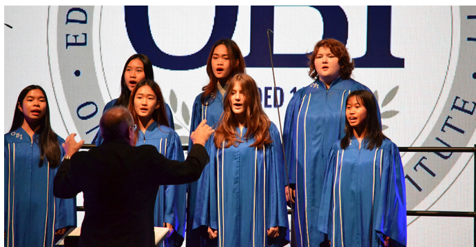
The OBI Choir sang at the annual meeting of the Kentucky Baptist Convention at Severns Valley Baptist Church in Elizabethtown, Kentucky, on 11/16.

The OBI choir may be few in numbers but they are large in sound and heart. Their growing confidence and improving musical skill could be heard in their songs each Sunday as they sang in six different churches and the Kentucky Baptist Convention this fall. The group also prepared music for the OBI chapel Christmas program. Check out the spring travel schedule, and if you're in the area, come and worship with them!