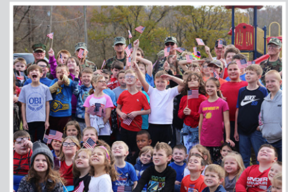
All grades walked to the Oneida Park on November 11th to participate in the community Veteran's Day Celebration. After the presentations, students met and talked with local veterans.