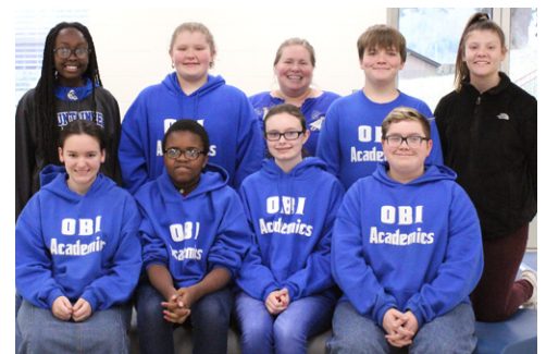
2017-18 Middle School Academic Team