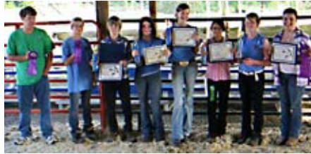
Our happy group posed to show off their ribbons and plaques.