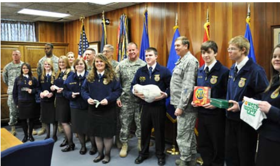
Our FFA chapter outranked 13 other schools and groups in giving.

For the second year in a row the Oneida Baptist Institute FFA was recognized as the top chapter in Kentucky for their contribution of over $2,000 to the state-wide "Support Our Troops" FFA fund-raiser. They earned most of the money with a campus bake sale in October. Friends of OBI sent in even more money through the mail after the event.