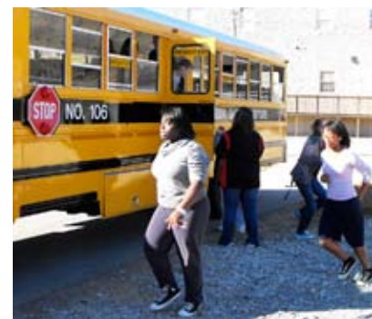
Also in November we had one of our bus evacuation drills (right). These drills are held quarterly to keep bus safety procedures fresh in the students' minds.