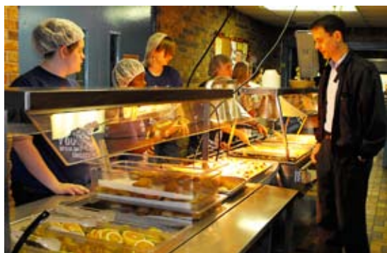
In November our FFA hosted their annual faculty/staff Harvest Breakfast (left), assisted this year by the Student Government Association.

If so, tell the family about OBI. Direct them to our web site for more information and admissions forms. Phone: (606) 847-4111 Fax: (606) 847-4496 Web: www.oneidaschool.org